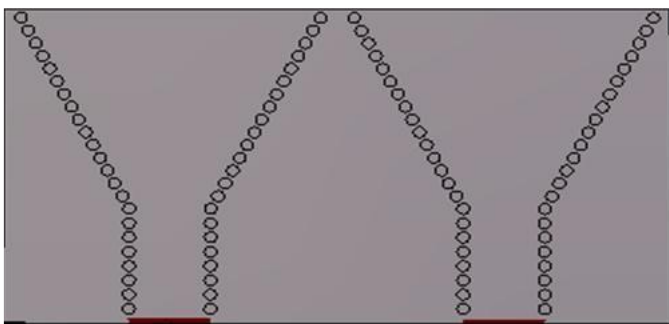
Fig. 7.2. Output2

The antenna achieved satisfactory gain and efficiency despite being implemented on an FR4 substrate. The overall performance confirmed that the design is suitable for compact mobile devices. The system also showed robustness under